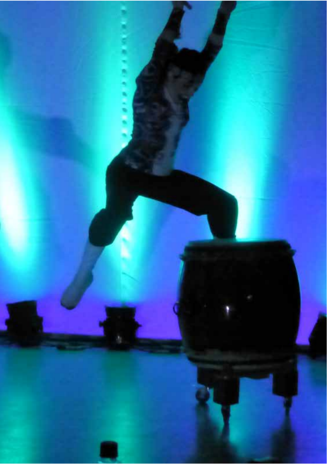
Festival goers will be treated to performances from a variety of cultures.