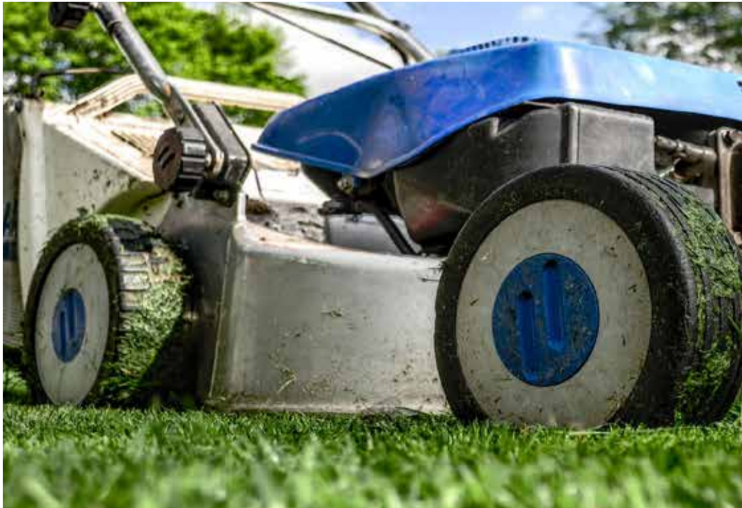
Neighbourhood residents could pool money on larger purchases like lawn mowers.