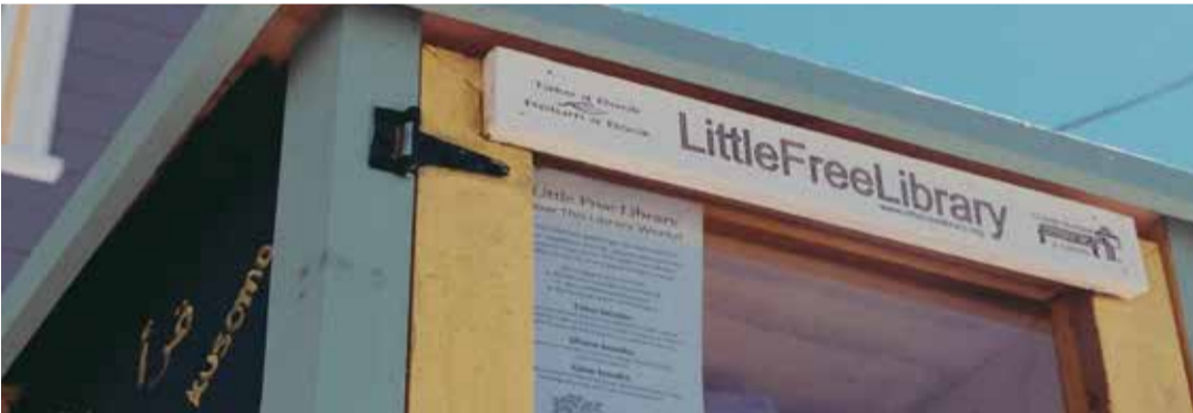
A Little Free Library is an opportunity for community members to share books.