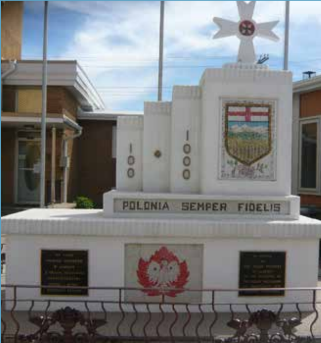
Spruce Avenue and area have a Polish history.

Surrounding the traffic circle to the west of Alberta Avenue are three Polish businesses which started in the 1980s: Polish Food Centre, Polonia Sausage and Deli, and Camelot Travel and Tours. These businesses can be traced to the second post Second World War wave of immigration when Poland was transitioning from Soviet rule to independence. At the time, Poland was subjected to martial law due to a strong solidarity movement operating separately from the Communist government.