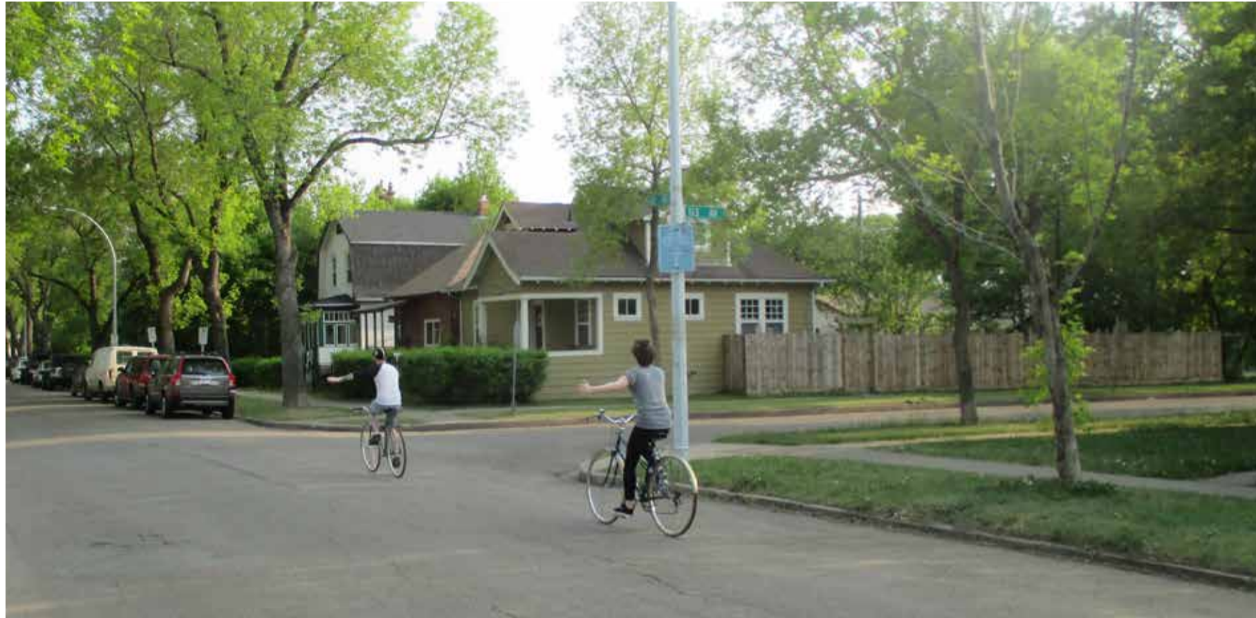
These cyclists are correctly signalling a left turn on 92 Street.