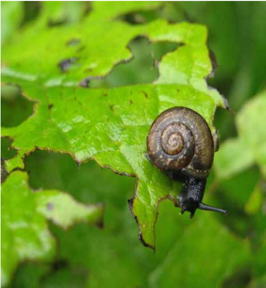
Gardeners can keep pests out naturally.

bin and refresh the beverage. Rabbits and small rodents can also be a problem if there isn't enough natural vegetation. Chicken wire or a mesh fence will deter these critters from enjoying your vegetables. Other strategies include: • Planting early. This can be risky in cooler climates such as ours, but it is a great way to prevent initial pest problems since many insects and pests are not around during these early months. • Weeding regularly. Healthy soil and a clean, weed-free garden is a good way to keep pests away. • Covering your crops if you can. A simple plastic mesh or remay cloth is great for keeping caterpillars and beetles away. • Rotating crops to decrease damage caused by over-wintering pests living in the soil. This will also promote healthier soils in the fall. • Removing infested plants as soon as possible to prevent further spread. Damaged or weak plants should also be removed as they will attract pests as easy targets. Some insects are beneficial. Ladybugs, spiders, ground beetles and wasps all eat destructive insects. Attract spiders by applying a thin layer of mulch in the spring. This provides them the cool environment they like, so they will stay and eat aphids or other pests. Planting herbs, flowers and clover around garden borders will attract pollinators and beneficial predator insects. A balanced, healthy garden is achievable with time and without commercial