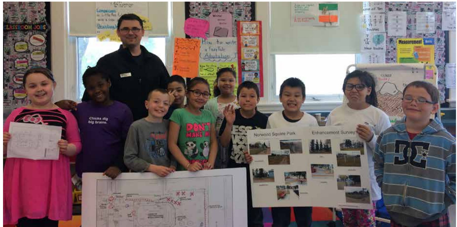
A Grade 3 class at Norwood School worked with the city to learn about decision making.