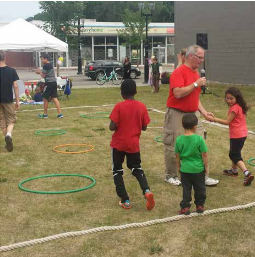
Community children enjoy lawn games at last year’s AveFest.