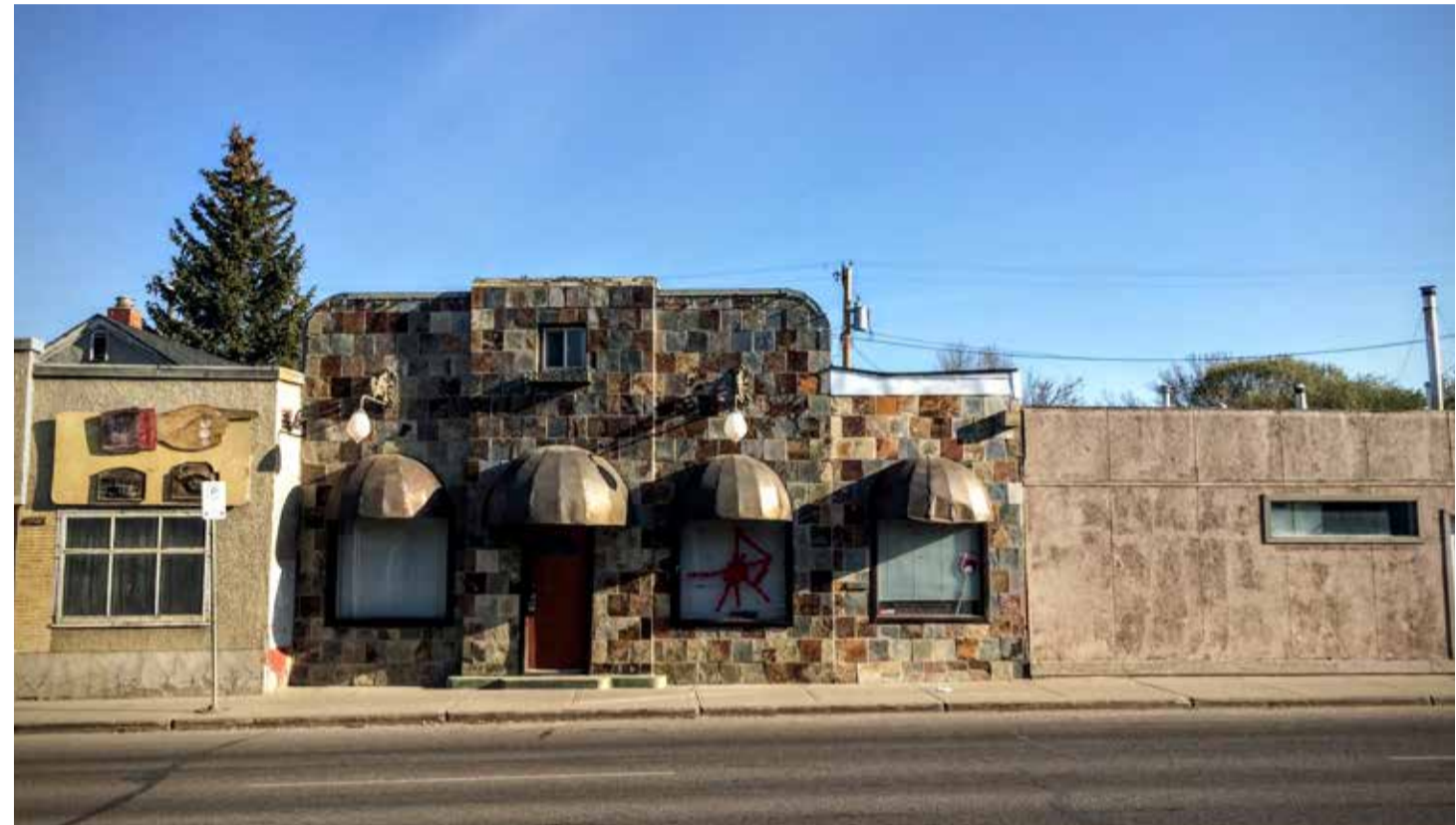
The delay in opening the new arts venue is due to bringing the building up to restaurant code. | Dave Von Bieker

Struggling through setbacks to open the doors of this venue