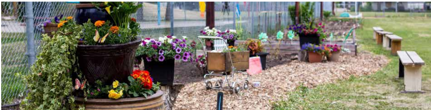
Some of the garden installation features at last year’s Rubber Boots and Bow Tie Garden Party.

Tickets: $10 in advance, $20 at the door. June 25 at 7:30 p.m.